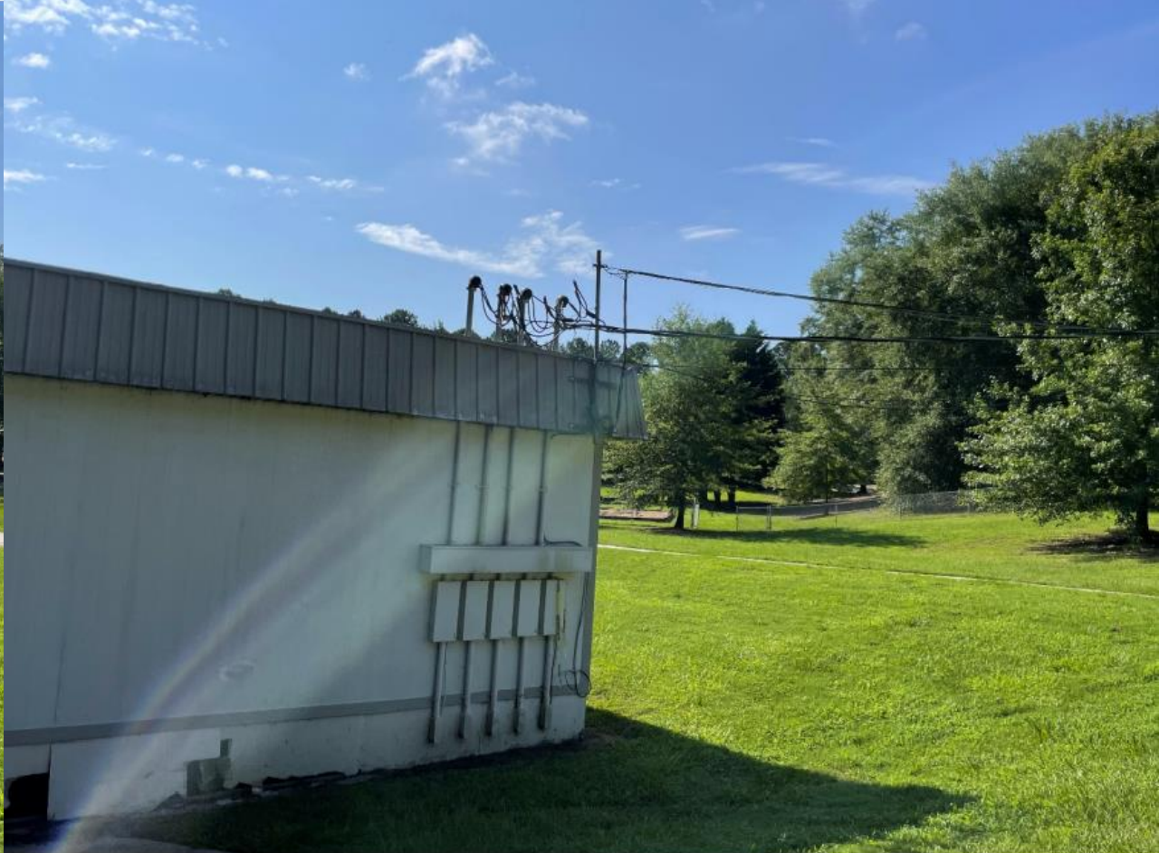
View Of Weatherhead