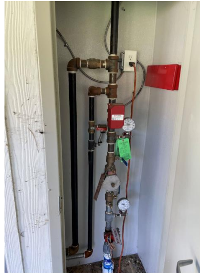
View of Sprinkler Riser