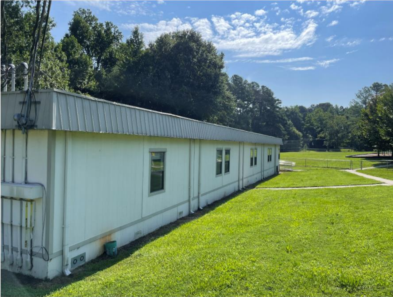
View Of Exterior