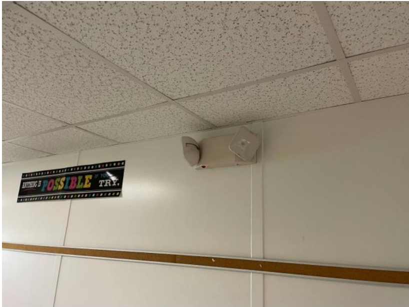
Replace Emergency Bug Eyes